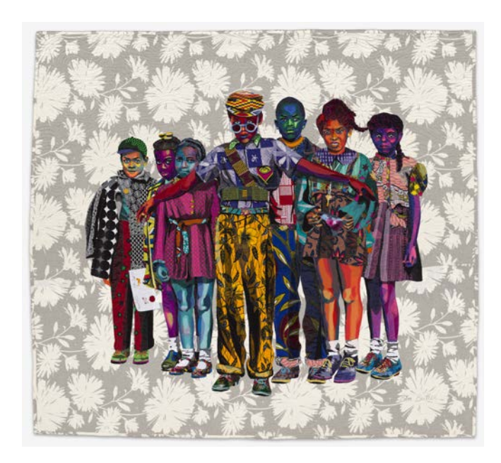
Bisa Butler, "The Safety Patrol" (2018) Cavigga Family Trust Fund (© Bisa Butler)

Butler dresses her subjects in a riot of West African Dutch and Ghanian wax cloth to achieve "an aesthetic of presence," as stated by Art Institute fellow Isabella Ko in the exhibition catalogue. She splices and layers these prints together until a bold, throbbing confluence of saturated color erupts; 50 pieces of cloth might constitute a single eye. Birds and airplanes soar, horses gallop, purples meet yellows, cerulean blues tango with magenta in geometric patterns, foliate designs crash into damask.